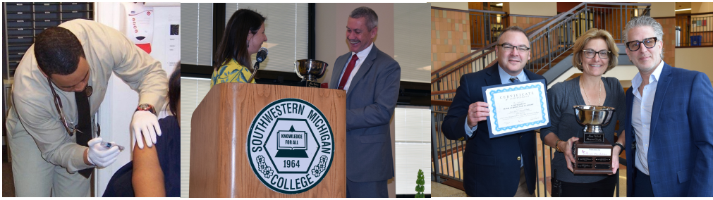
Street Medicine, an AF grant recipient, administering flu vaccine